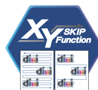
The printhead prints only where there is an image by skipping the blank space saving work time.