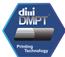
The extreme highest printing quality output achievable by banding free and conditioning free.