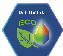
Dilli UV ink for high-end NEO TITAN PLUS Series

Special Features : UV LED curing system (corresponding to heat-sensitive materials) | Automatic head gap system | Anti-static system: Protects materials from static electricity | Head collision prevention system | Auto vacuum control system: Corresponds to various material sizes | White ink circulation system (Dilli Auto White System)